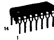
N SUFFIX PLASTIC PACKAGE CASE 646